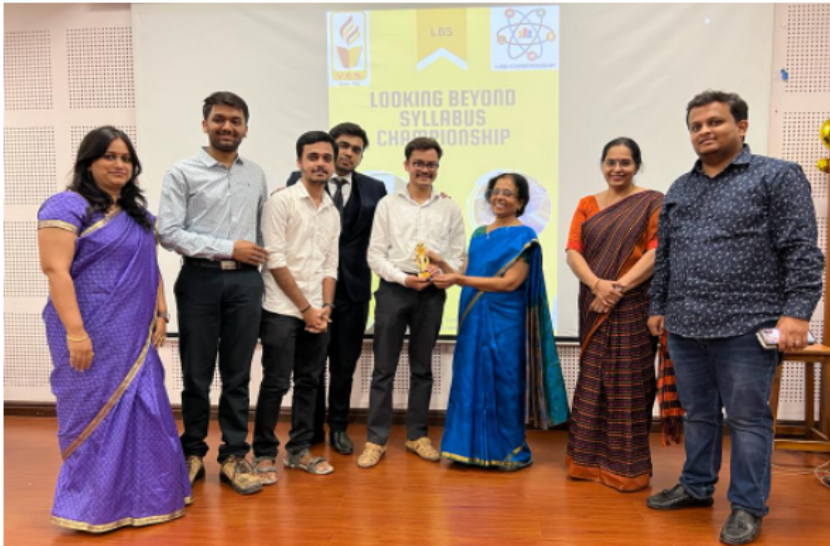
Fig. 7 2nd Runners Up team with trophy