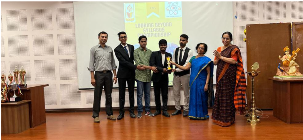
Fig. 5 Winning team with trophy

The prize distribution ceremony was held on 21st April 2022, on annual day.