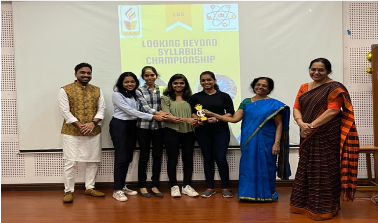
Fig. 6 1st Runners up team with trophy

(Affiliated to University of Mumbai, Approved by AICTE & Recognized by Govt. of Maharashtra)